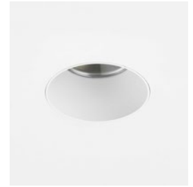
CODE: 1392019 FINISH: MATT WHITE

TO MAINTAIN THIS PRODUCT TO ITS BEST CONDITION, PLEASE VIEW OUR CARE AND CLEANING GUIDE ON THE SUPPORT SECTION OF THE ASTRO WEBSITE.