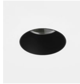
CODE: 1392016 FINISH: MATT BLACK