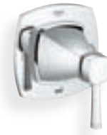
19 942 000 5-way diverter ● ● ● ● ●