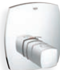
19 941 000 Central thermostat ● ● ●