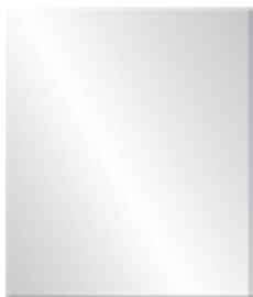
● Chrome – 000