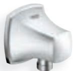
27 970 000 Shower outlet elbow