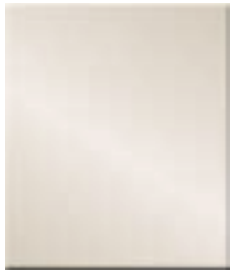
● Brushed Nickel – EN0

Luxurious and elegant – the chrome/gold finish is the quintessence of style and comfort. Gold accents on the base, spout and lever demonstrate Grohe's attention to detail and passion for extraordinary design. GROHE StarLight® technology means that our faucets are particularly scratch-resistant and keep their shine for years.