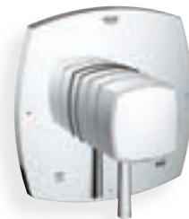
19 938 000 USA / Canada Grohflex shower/bath dual function Pressure balance valve trim ● ● ●