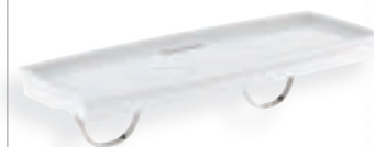
18 651 000 GROHE EasyReach™ storage