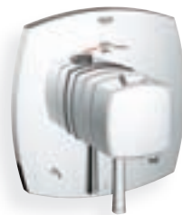
19 939 000 USA / Canada Grohflex shower/bath dual function Thermostatic trim ● ● ●