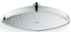
27 974 000 Head shower 210 mm 1 spray pattern: Rain