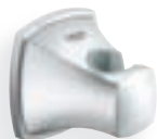
27 969 000 Hand shower holder