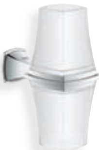
40 661 000 Lamp