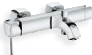
23 317 000 Bath/shower mixer ● ● ●