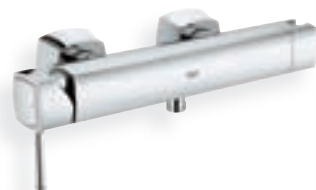
23 316 000 Shower mixer ● ● ●