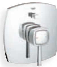
19 920 000 Bath/shower mixer ● ● ●