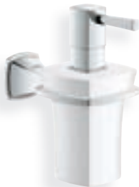
40 627 000 Shelf + Soap dispenser