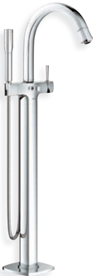
23 318 000 Bath/shower mixer floor mounted ● ● ● ●