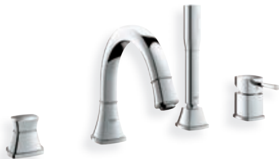
19 936 000 4-hole bath combination ● ● ● ●