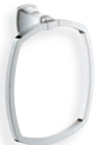
40 630 000 Towel ring