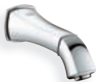
13 341 000 Bath spout ● ● ● 13 342 000 USA / Canada ● ● ●