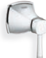
19 944 000 Concealed valve ● ● ● ●