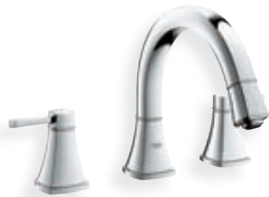
25 154 000 USA / Canada Roman Tub Filler ● ●