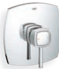
19 932 000 Shower mixer ● ● ●