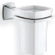
40 626 000 Holder + Tumbler