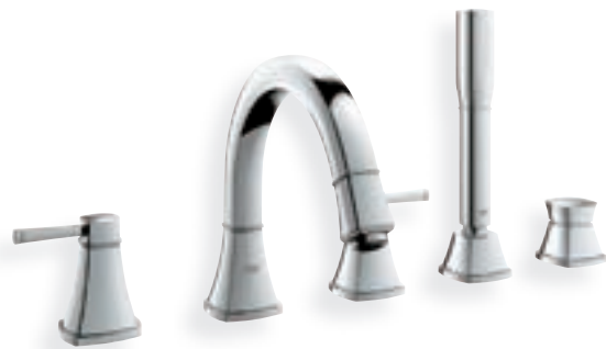
19 919 000 5-hole bath combination ● ● ● ● ●