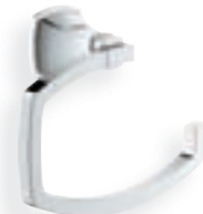
40 625 000 Toilet paper holder