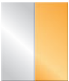
● Chrome / Gold – IGO

Bright and precise – the Grandera™ collection in the chrome finish casts your bathroom in a very special light. And for a very, very long time. GROHE SilkMove® technology ensures ultimate ease of use.