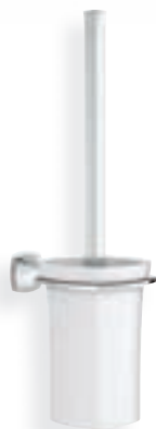
40 632 000 Toilet brush set